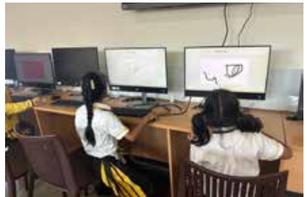
Class discussions, art, Guest talk interaction,