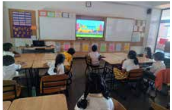
Presentation- Rights around the world