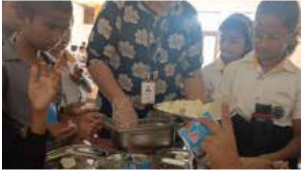
Life skill -Non-fire cooking