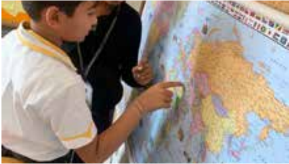
Identifying countries in the map to research about legal rights