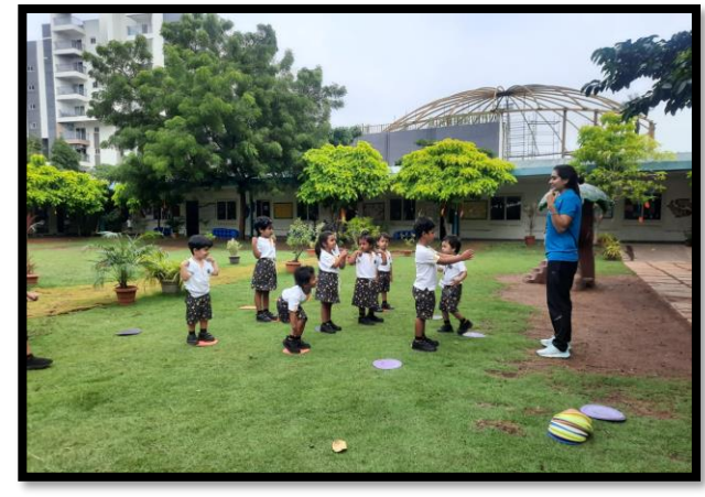
PE - Students practicing simple jumping exercises, Zig zag walking and stretching exercises.