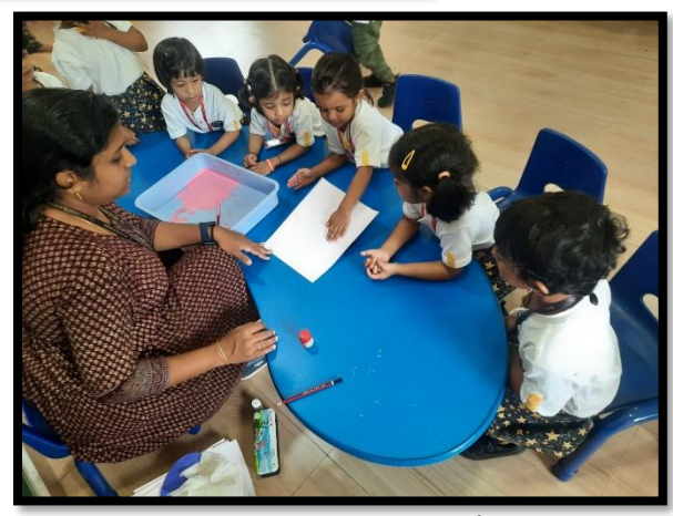
Students explored different materials that can be used for colouring, primary colours and created their artworks.