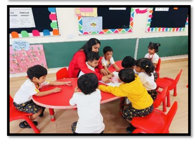
TD Language -Introduction to the letters 'a, t & p ' using different learning engagements.